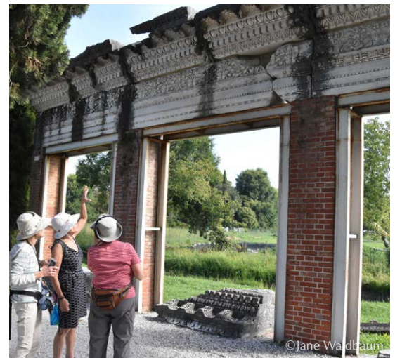
Photos (from top): Brescia Castle, Mosaics at the Basilica in Aquileia, Aquileia

Today we check out of our hotel and take a motorcoach to Trieste, our home base for the balance of our journey. On the way, stop in Verona to visit the 1 st -century A.D. Roman arena, possibly the best-preserved ancient amphitheater, and for a walking tour of the hidden gems of Verona (the city is a UNESCO World Heritage Site). Our special lunch today is a typical Veronese meal at Ristorante Maffei, which was built on the site of the 1 st -century B.C. Roman Capitol, part of which is visible in its wine cellar. Continuing on to Trieste, we check-in to our hotel. Dinner is on your own. Three nights at the 4-star DoubleTree by Hilton Trieste. (B,L)