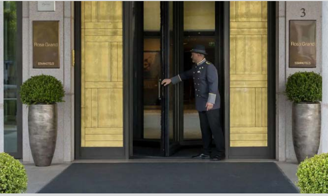
MILAN: Two nights at the 4-star Rosa Grand Milano