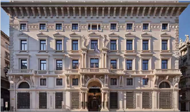
TRIESTE: Three nights at the 4-star DoubleTree by Hilton Trieste