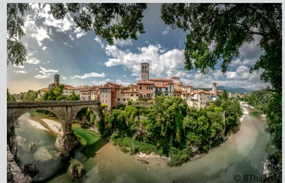
Photos (from top): Trieste, theater at Brescia, fresco at Tempietto Longobardo, Cividale del Friuli