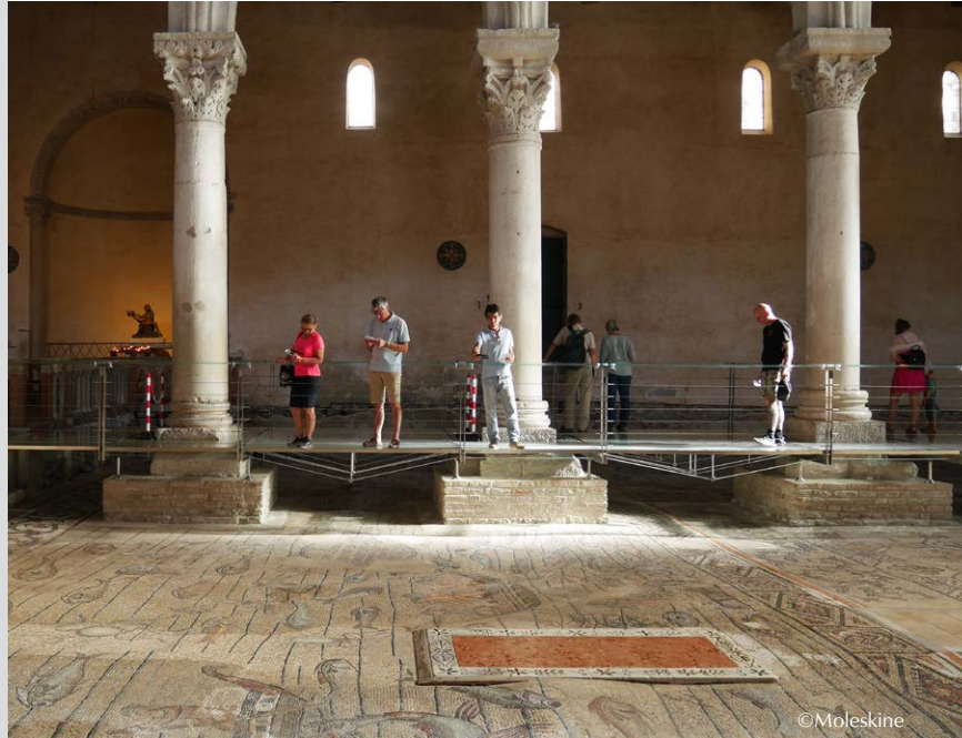
Patriarchal Basilica, Aquileia

The Archaeological Institute of America (AIA) is the oldest and largest archaeological organization in North America. The AIA seeks to educate people of all ages about the significance of archaeological discovery. For more than a century the AIA has been dedicated to the encouragement and support of archaeological research and publication, and to the protection of the world's archaeological resources and cultural heritage. By traveling on an AIA Tour you directly support the AIA while personally gaining the benefit of the AIA's network of scholars and worldwide contacts.