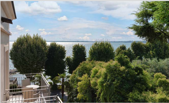
DESENZANO DEL GARDA: Five nights at the 4-star Villa Rosa Hotel