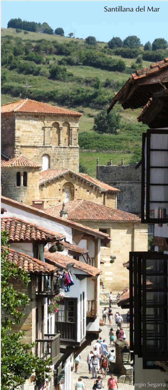
Santillana del Mar

Investigate southwestern Europe's most extraordinary prehistoric caves, including Lascaux IV, a new, exact reproduction of one of the most remarkable prehistoric sites ever discovered; Altamira II, a precise replica of the original that is often called the "Sistine Chapel of Prehistoric Art"; Atapuerca, the most significant early human site in western Europe; Las Monedas Cave and Cueva del Castillo, where 455 animal likenesses were painted and engraved some 22,000-14,000 years ago, but other motifs such as hand stencils and red dots have been dated to more than 40,000 years ago, meaning that they may well have been made by Neanderthals; Cognac, which features paintings of extinct megaloceros and mammoth; Pech Merle, known for its "negative handprints"; and others.