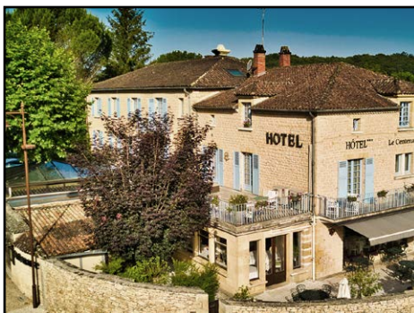
Les Eyzies, France: Four nights at the 4-star Hôtel le Centenaire