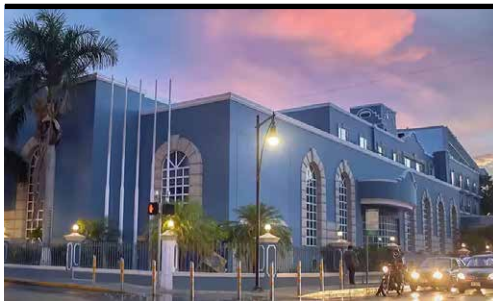
Villa Mercedes by Hilton