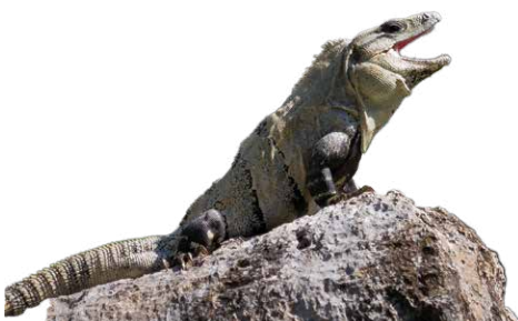
Photos (top to bottom): Izamal Convent; Ek Balam; The Great Museum of the Maya World, Mérida; iguana at Chichén Itzá