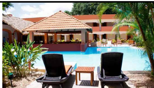
Hotel Villas Arqueológicas Chichén Itzá