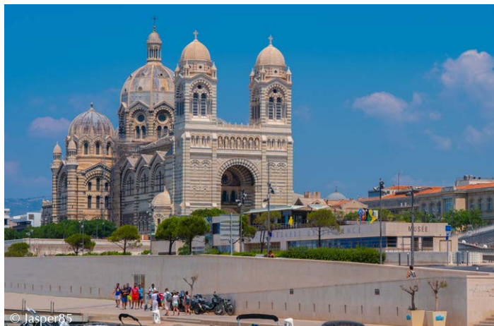
Marseille Cathedral behind Cosquer Méditerranée, Marseille