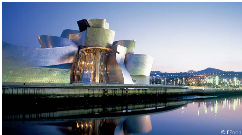
Guggenheim Museum, Bilbao