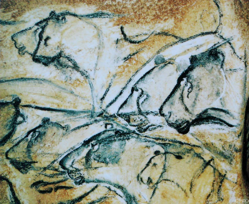
Images of lions in the Pont-d'Arc Cavern

a group lunch we visit the small but impressive museum in Tautavel before driving to our hotel in Narbonne. The balance of the day and dinner are at leisure. Overnight at the 4-star Hotel Le Mosaïque . (B,L)