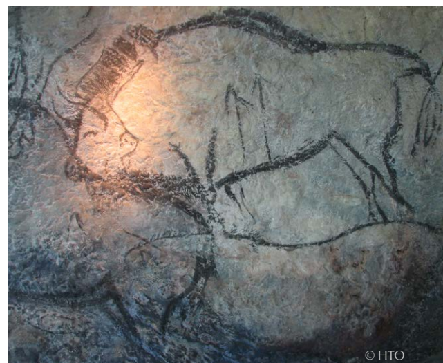
Painting of bison from the Salon Noir of Niaux Cave

Cover: (left, from top) Chauvet Cave, Niaux Cave, negative hand prints at Gargas Cave; (right) Entrance to Mas d’Azil cave