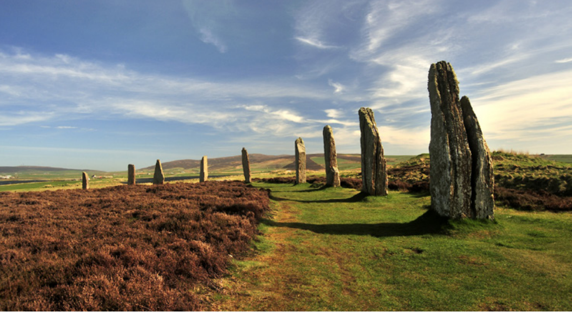
Ring of Brodgar