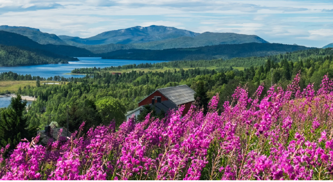
Flowers of Norway