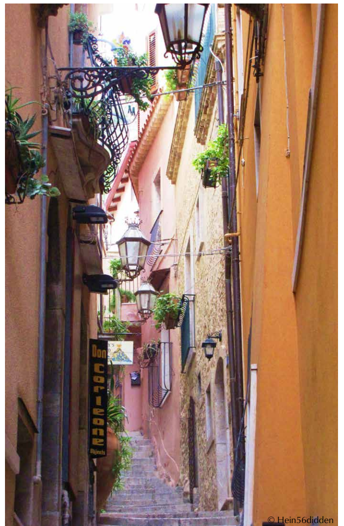
A charming side street in Taormina.