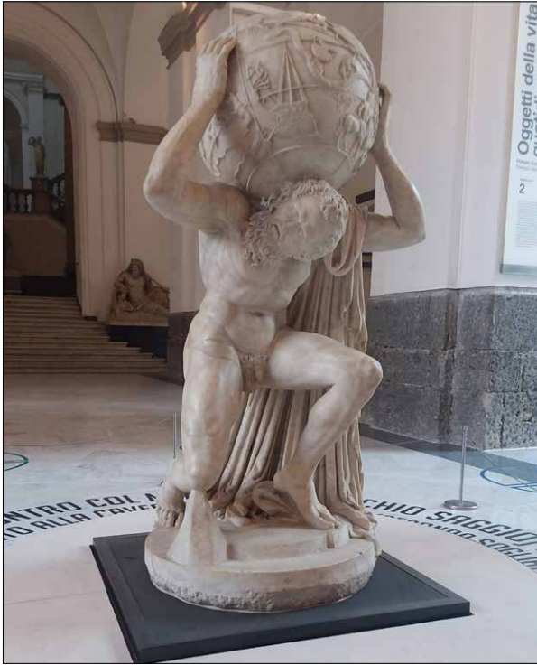
Naples Archaeological Museum

Prst Std U.S. Postage PAID Putney, VT Permit 1