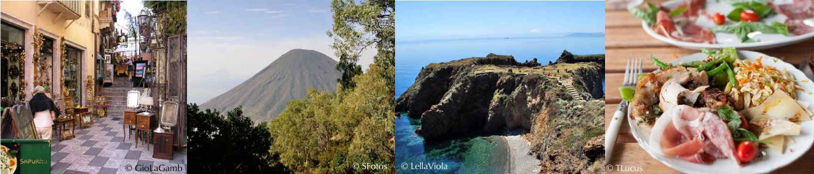
Left to right: Taormina shops, Salina, Panarea, local cuisine