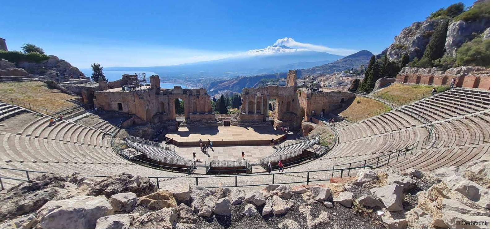
Taormina's ancient Greek theater with Mt. Etna, which we will hike, in the background.