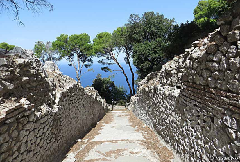
Villa Jovis, one of twelve ancient Roman villas on the island of Capri.