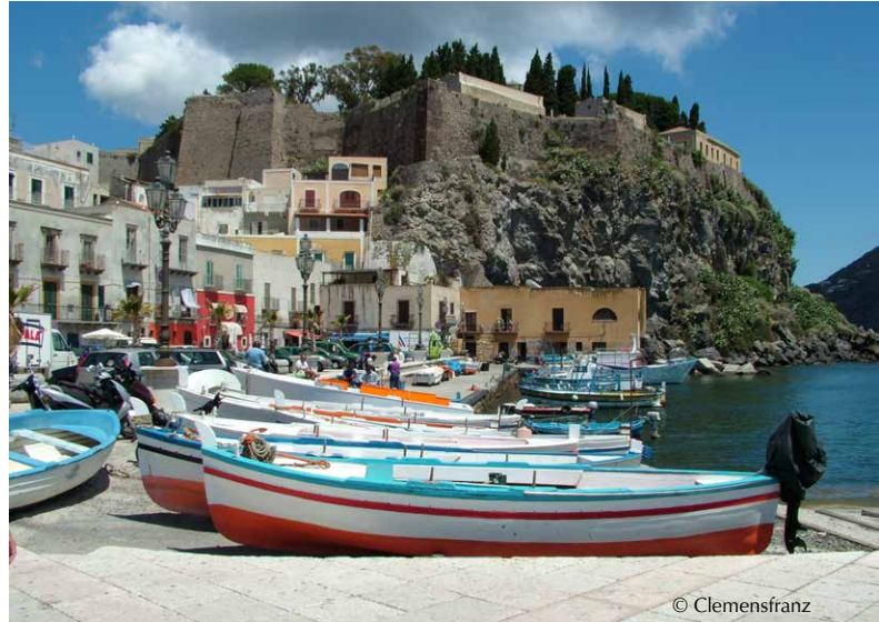
Lipari, one of the seven Aeolian Islands off the coast of Sicily.