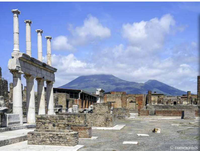
View of Mt. Vesuvius from Pompeii