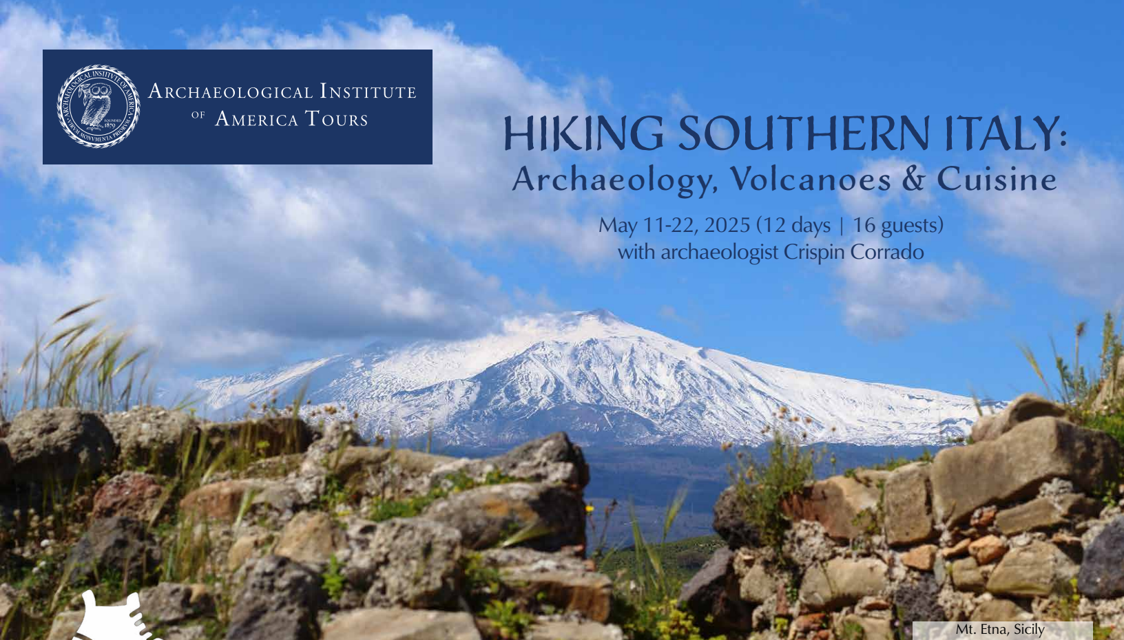
Mt. Etna, Sicily

May 11-22, 2025 (12 days | 16 guests) with archaeologist Crispin Corrado