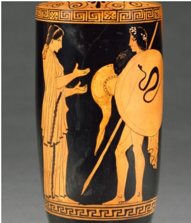
Classical Greek Oil Jar with a Departing Warrior, J. Paul Getty Museum. Phiale Painter, Attic, about 450 BCE.