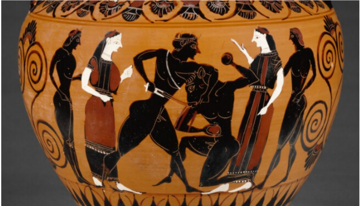
Archaic Greek Storage Jar with Theseus Slaying the Minotaur , J. Paul Getty Museum. Attributed to Group E (Workshop of Exekias), Attic, about 550 BCE.