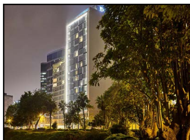
Lima: Two nights at the 5-star AC Hotel Miraflores