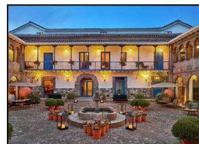
Cusco: Three nights at the 5-star Palacio del Inka