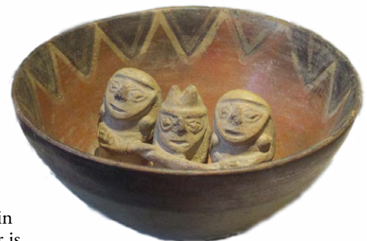
Pre-Hispanic Pottery (Larco Museum, Lima)