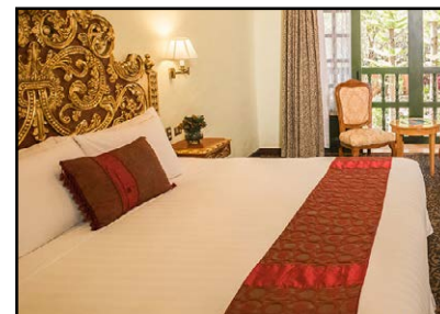
Urubamba: Three nights at the 5-star Aranwa Sacred Valley Hotel and Wellness