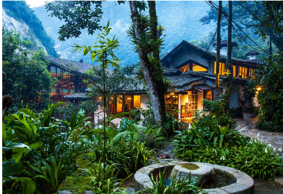
Inkaterra Machu Picchu Pueblo Hotel

The high altitude of Cusco (11,150 feet) could cause problems for travelers with certain health conditions. Average temperatures in October range from the mid- to upper 60s F during the day to the mid-40s F at night. Complete pre-departure details will be sent to participants.