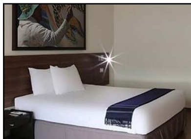
Chiclayo: Three nights at the 4-star Casa Andina Select Chiclayo