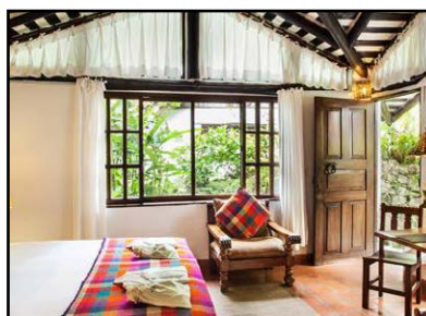
Machu Picchu Pueblo: Two nights at the 5-star Inkaterra Machu Picchu Pueblo Hotel