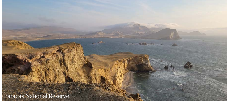
Paracas National Reserve