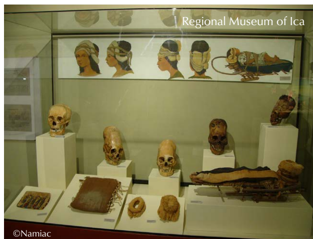
Regional Museum of Ica

This morning we will visit Cahuachi, a major ceremonial center of the Nazca culture, dating from about A.D. 1 to 500. This vast site comprises more than 40 mounds topped with adobe structures. We will return to Nazca and visit the Antonini Museum, a small, comprehensive archaeological museum showcasing a diverse array of Nazca artifacts, including mummies, pottery, textiles, and more. Exhibits describe the geography of the desert coast and how to decipher the symbols and