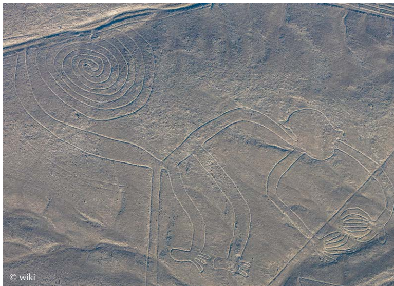
Take a scenic flight over the Nazca Lines—famous geoglyphs and a UNESCO World Heritage Site.