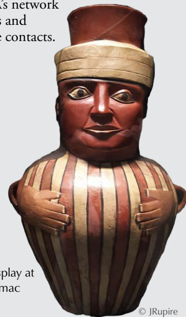
Vessel on display at the Pachacamac Museum

The Archaeological Institute of America (AIA) is the oldest and largest archaeological organization in North America. The AIA seeks to educate people of all ages about the significance of archaeological discovery. For more than a century the AIA has been dedicated to the encouragement and support of archaeological research and publication, and to the protection of the world's archaeological resources and cultural heritage. By traveling on an AIA Tour you directly support the AIA while personally gaining the benefit of the AIA's network of scholars and worldwide contacts.