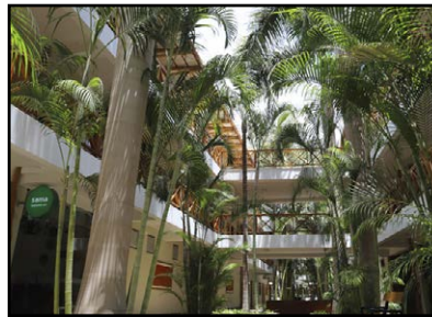
Nazca: Two nights at the 4-star Casa Andina Nazca