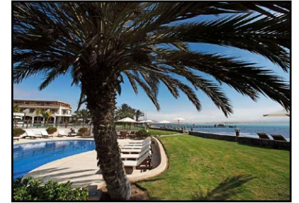
Paracas: Two nights at the 5-star La Hacienda Bahía Paracas