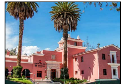
Arequipa: Two nights at the 5-star Costa del Sol Arequipa