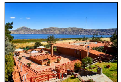
Puno: Two nights at the 4-star Casa Andina Premium Puno