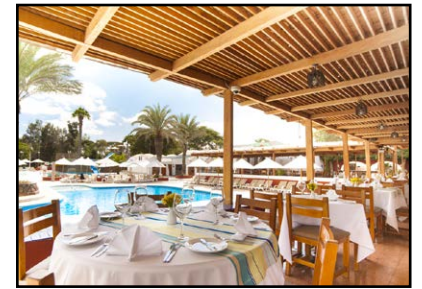
Ica: One night at the 4-star Las Dunas Hotel