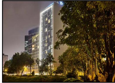
Lima: Two nights at the 5-star AC Hotel Lima Miraflores