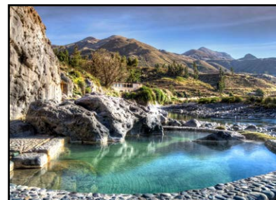
Colca Canyon: Two nights at the 4-star Colca Lodge Spa & Hot Springs